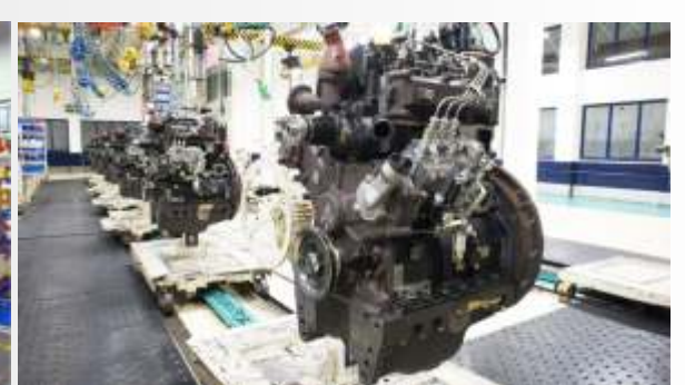
Eicher Engines are Manufactured and Marketed by TAFE Motors and Tractors Limited, under a license from Eicher Goodearth Private Limited. "EICHER" is the exclusive trademark of Eicher Goodearth Private Limited.